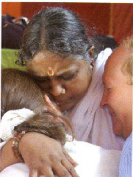
A couple receiving Amma's embrace (darshan) during her European tour last year.

W ho is Amma? Her name is Mata Amritanandamayi, but millions over the world know her as Amma (the Indian word for mother), the mother of love and compassion.