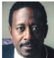
Clarke Peters, Actor and Writer

"Silence is where I go when I need to be recharged, where I need to sit and focus, where I need to be on top of that mountain and looking at the world... Silence is a wonderful place to be. Stay there as long as you can."