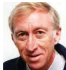
David Hemery, Former Olympic Athlete

"One of the most priceless, rare things in today's world is time. Even if somebody wants to do something and there's a need, they will avoid it, if it takes too much time. But, if you say 'just-a-minute'... A minute anyone can take, whilst moving from one place to another. You can find a minute somewhere in between. The principle we are talking about is the principle of acquiring a taste. If you are going to taste something, even if you don't eat it, the taste becomes unforgettable. Then, after that, even if you want to forget it, you can't forget it."